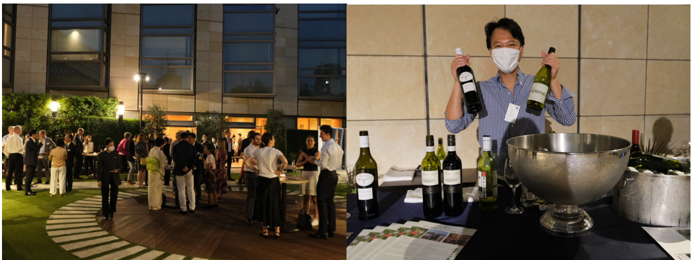
Food, Agriculture & Hospitality Committee Gourmet Food & Wine Garden Party (August 2022)

Committee membership is not limited - members may belong to as many committees as they wish. Whether you have unresolved trade issues or just want to share ideas and experiences with like-minded people whilst also extending your network, becoming a member of a committee is one of the best ways to benefit from the ANZCCJ. Aspiring Executive Council members are encouraged to actively participate in the Chamber committees ahead of running in the elections as a way to build their understanding of the Chamber.